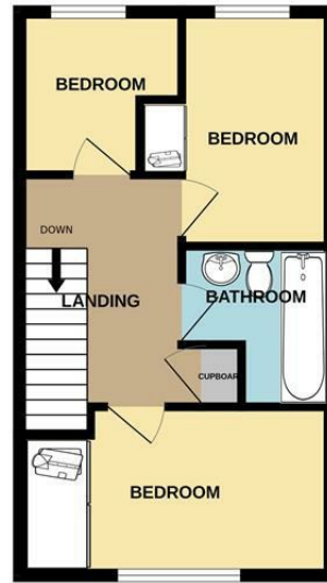
1ST FLOOR 341 sq.ft. (31.6 sq.m.) approx.